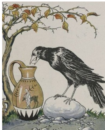
Aesop's Fable of the Raven and the Pitcher reminds us of the value of creativity.